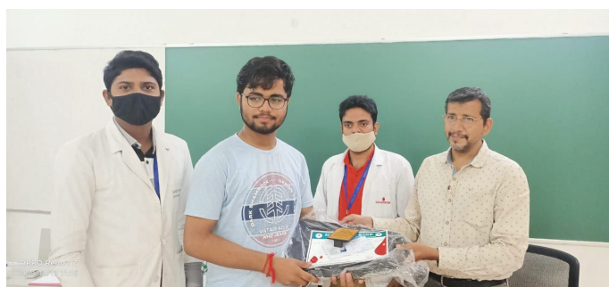
Blood Donation Camp -Nov 21

Two Blood donation camps (in an interval of 4 months) were organized during my tenure recording a total of 106 donations. The camps were held by SCCH blood bank and AIIMS Raipur respectively in November 2021 and March 2022.