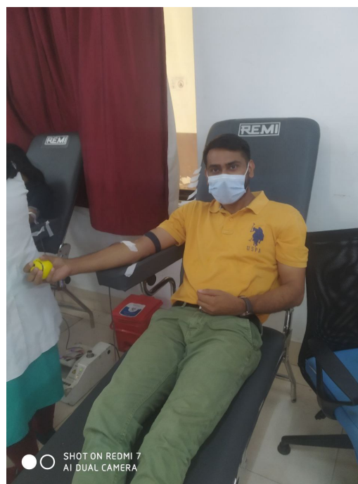
Blood Donation Camp- Mar 22